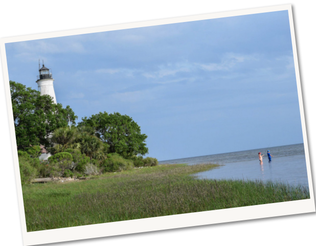
Wakulla Springs, Lake Ella, St. Mark's National Wildlife Preserve, and Cascades Park are a few other nearby noteworthy hangouts.

Florida State University's campus is beautiful as well, and if you are a college football fan, you should check out the stadium.