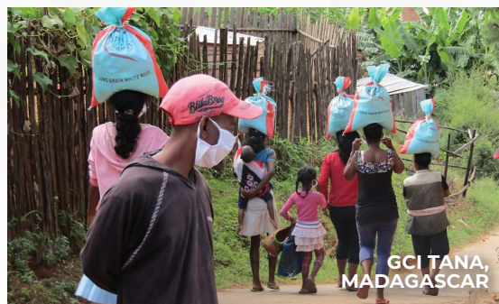
GCI TANA, MADAGASCAR

Join us in praying for connections and relationships to be created through our new Affinity Spaces -- small groups that gather around any topic. We have a free online yoga class and a sewing circle in the works as our first two offerings. These Spaces will be offered to our community free of charge.