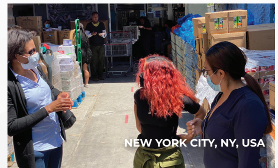
NEW YORK CITY, NY, USA

We joined with local organizations in opening our doors and warmly welcoming college students! Please join us in praying for these students, that they may know our Gracious God is with them in this season and whatever comes next. Also, join us in praying for eyes to see the opportunities God has for us to make deeper connections in our neighborhood.