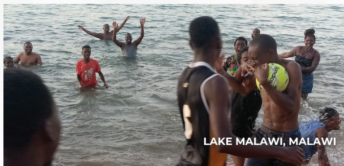
LAKE MALAWI, MALAWI

Jesus, as our congregations join with you in worship across the globe, we pray that the services will inspire and fill all who attend with hope. As we gather digitally or in smaller in-person groups, may we receive your truth to be sent out and share your love with our neighbors.