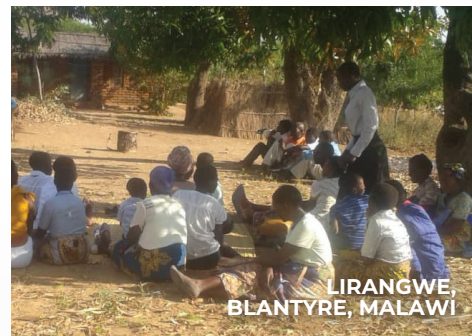
LIRANGWE, BLANTYRE, MALAWI

We are grateful for the $10,000 we received for hygiene needs for the members of our neighborhood who frequent our community kitchen. Join us in praying that all who receive these gifts will see the goodness and provision of our loving God. Thank you for your support and prayers for our ministry and mission to be the hands and feet of Jesus in our community and abroad.