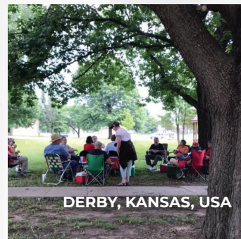
DERBY, KANSAS, USA

Many of our congregations are looking for new facilities as we begin to regather. Join us in praying that God will lead us to new locations and that he will provide us with more than just a meeting place, but a space to minister to our neighbors.