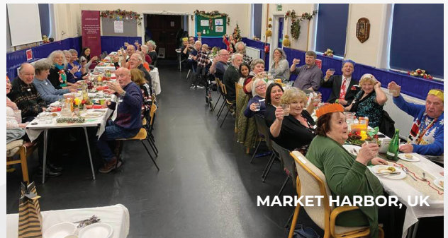
MARKET HARBOR, UK

Father, Son, and Spirit, we follow your lead and answer your call as we share your love with our neighbors. We thank you for the ways our American Heritage Girls Troop allows us to engage with our neighbors. May our girls continue to grow in grace and knowledge of you through the time they spend as a troop.