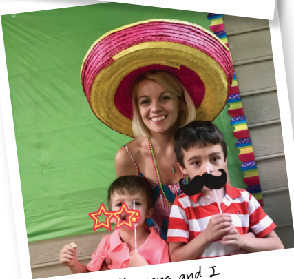
My sons and I