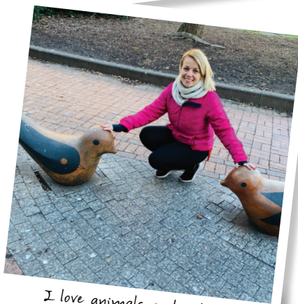
I love animals and nature