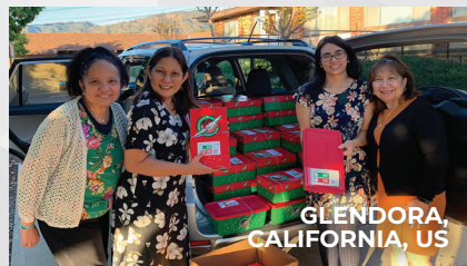
GLENDDORA, CALIFORNIA, US