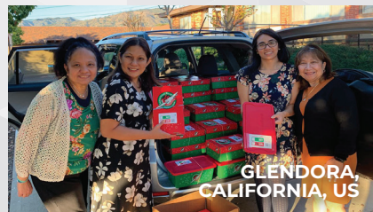
GLENDDORA, CALIFORNIA, US