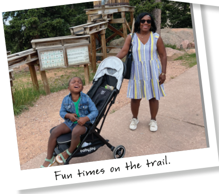
Fun times on the trail.