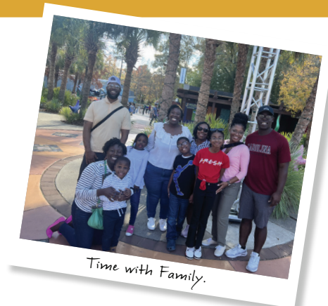
Time with Family.

I have faith that God will continue to lead and guide the work that is being done through GC Ladson, and I look forward to the spiritual growth this work will bring.