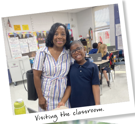
Visiting the classroom.