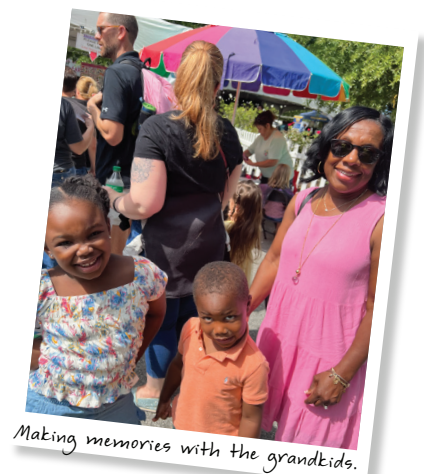
Making memories with the grandkids.

ANY JOB THAT GOD HAS GIVEN YOU TO DO WILL BE A BLESSING FOR YOU AND EVERYONE INVOLVED. KNOW THAT WHAT MAY SEEM LIKE A FAILED EVENT TO YOU IS GOD GETTING YOU READY FOR HIS FUTURE WORK THROUGH YOU. SO JUST KEEP WORKING.