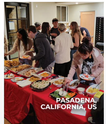
PASADENA, CALIFORNIA, US

Guilt can hold us captive, enslaving us to our own efforts to eliminate it or escape it. The accuser likes to fasten our attention on those things we are guilty of, reminding us constantly of our faults and shortcomings. Even if we accuse ourselves, God knows the truth. God has taken all guilt and shame upon himself in Jesus, and he binds us to himself with cords of everlasting love and grace. Whatever guilt there may be, however deserving of it you may be, surrender it to Jesus and receive in its place his forgiveness and new life. How might you replace guilt today with Jesus' assurance of redemption and renewal?