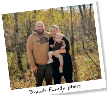
Brandt Family photo