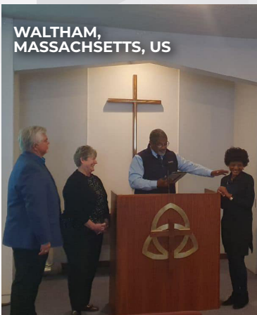
WALTHAM, MASSACHUSETTS, US