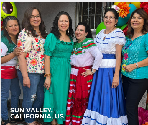
SUN VALLEY, CALIFORNIA, US

PLEASE EMAIL INFO@GCI.ORG WITH DETAILS AND PHOTOS.