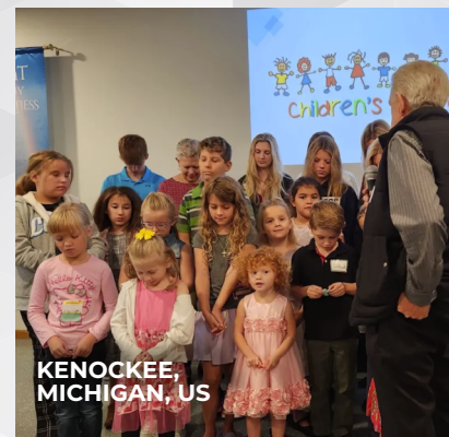
KENOCKEE, MICHIGAN, US

Loving God, we praise you for the five youth baptisms our congregation celebrated last month. As we welcome our newly baptized members into our fellowship, we thank you once again for your gift of grace and the forgiveness you give each of us.