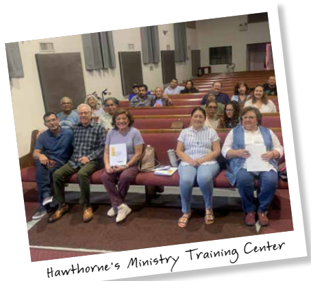
Hawthorne's Ministry Training Center