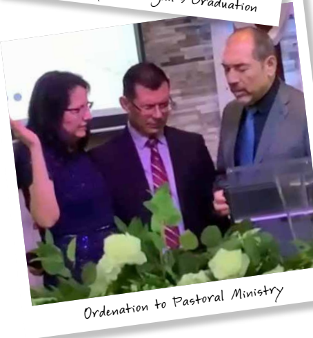
Ordination to Pastoral Ministry