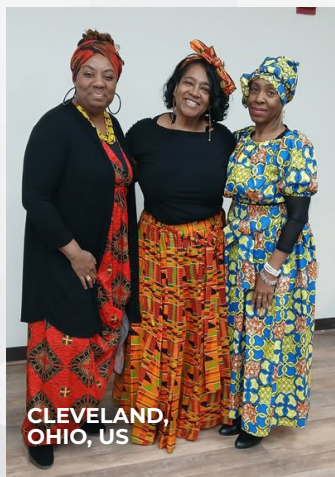
CLEVELAND, OHIO, US

Merciful Christ, we lift up the people of South Kivu and all those affected by the conflict in Eastern DRC. Surround our brothers and sisters with your presence, granting them strength, courage, and safety in the midst of turmoil. Bring comfort to those who are displaced, healing to the wounded, and hope to all who suffer. We pray for peace to take root, for justice to prevail, and for your light to shine even in the darkest circumstances. In your mercy, Lord, be their refuge and restore their land.