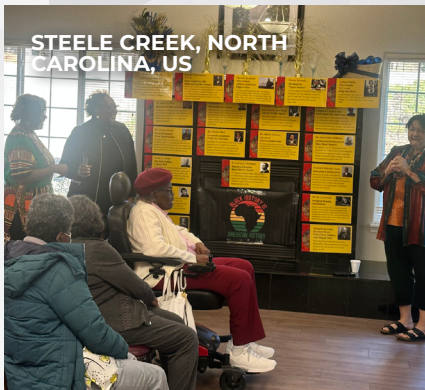
STEELE CREEK, NORTH CAROLINA, US