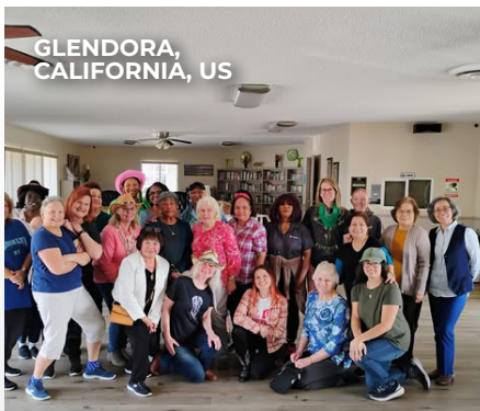
GLENDORA, CALIFORNIA, US

Almighty God, we pray you graciously to behold this your family, for whom our Lord Jesus Christ was willing to be betrayed, and given into the hands of sinners, and to suffer death upon the cross, who now lives and reigns with you and the Holy Spirit, one God, for ever and ever. Amen. *