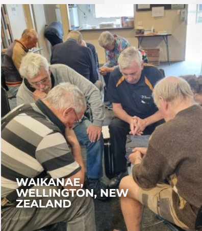
WAIKANAE, WELLINGTON, NEW ZEALAND

Everlasting Father, we rejoice in the joyful gathering of children who came to discover your love through this year's VBS. Thank you for every moment of laughter, learning, and worship, and for the theme of forgiveness that pointed young hearts to your grace. We celebrate the unity of your people who served together faithfully, and the seeds of truth planted in each child. May this time continue to shape their hearts and lead them to walk in your ways.