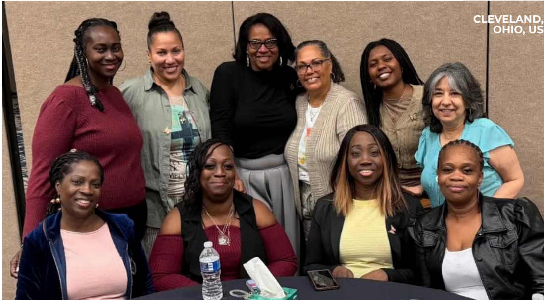
CLEVELAND, OHIO, US

"God speaks in the silence of the heart. Listening is the beginning of prayer."