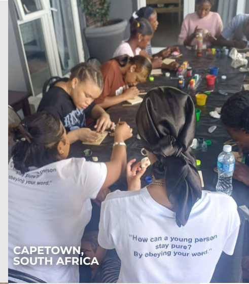
CAPETOWN, SOUTH AFRICA