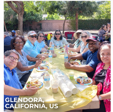
GLENDORA, CALIFORNIA, US

Faithful Father, we rejoice in the four baptisms we celebrated and give thanks for the visible witness of your grace at work in these lives. Thank you for drawing each person closer to you and reminding us of the hope, renewal, and belonging we share in Christ. May the joy of this celebration continue to encourage our fellowship and strengthen us as we walk together in faith. Guide each newly baptized believer as they continue growing in your love and truth.